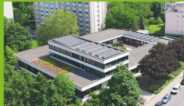
Status: 221101